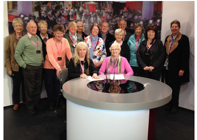
London Studies 4 audition for a BBC new reader post!

To ensure we have a U3A that continues to meet the need of our members and provide a wide range of interesting and rewarding activities to participate in, we need volunteers to step forward and help run it. There are many ways you can do this - being part of the Committee or one of the teams supporting its work, running a group or just helping out at social events. Why not give it a go and help Knole develop and thrive for another 10 years!