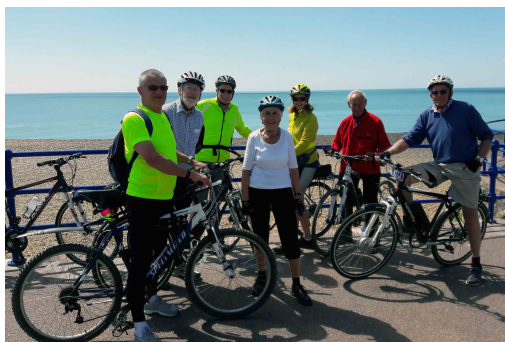
The Rusty Riders visit the seaside