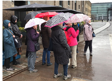
London Studies 1 brave the rain to tour the King's Cross development

All things I wouldn't have done if I hadn't joined Knole U3A.