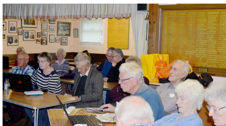
The Computer Group at work

the planning stage. Many U3As twice the size of Knole, have fewer groups for their members to participate in, and often with a far narrow range of activities. We are very fortunate to have a high proportion of our members prepared to lead these groups and many members prepared to assist the group contacts in the running of the groups. We are also fortunate to have a great mix of academic, leisure and cultural activities represented, which provide many opportunities for our members to develop new skills, interests and broaden their social contacts in retirement (and some of us in semi retirement!). We also have developed very good contacts with a few local U3As, providing access to a further 22 groups, and we are exploring the scope for sharing more activities with them (notably Sevenoaks, Westerham and Edenbridge U3As) in the future.