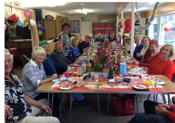
The Singing for Pleasure Group enjoy a party between songs

We sing about 13 songs each session and the content is varied covering folk, jazz, popular and country songs plus show songs, which are particularly popular. We have two guitarists, a keyboard player and clarinet player to accompany the singers. We currently have approximately forty members.