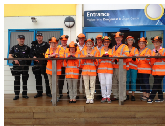
The Science Group visit a nuclear power station

I joined Knole U3A a few months before retiring from part-time consultancy as a way to meet people and take part in groups such as walking and London Studies. What I did not expect was the range of interesting people I would meet and how I could use skills developed at work, which enabled me to contribute to Study Groups and to help run them.