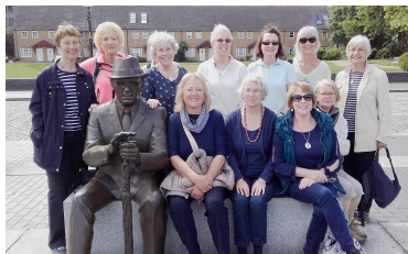
A London Walks Group make a friend

The majority of these new members came from the Sevenoaks postcodes, but one of the characteristics of Knole from the beginning was that members came from far afield, Orpington, West Kent, the Darenth Valley and even further away. Some were already a member of another U3A but were attracted by a specific subject that Knole offered, or by being in at the beginning and the promise of getting to know a new group of people.